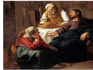
Christ in the House of Martha and Mary, Johannes Vermeer, before 1654-1655, oil on canvas (National Gallery of Scotland, Edinburgh) - Mary is seated at the feet of Jesus

July 18 th - 16 th Sunday of Ordinary Time